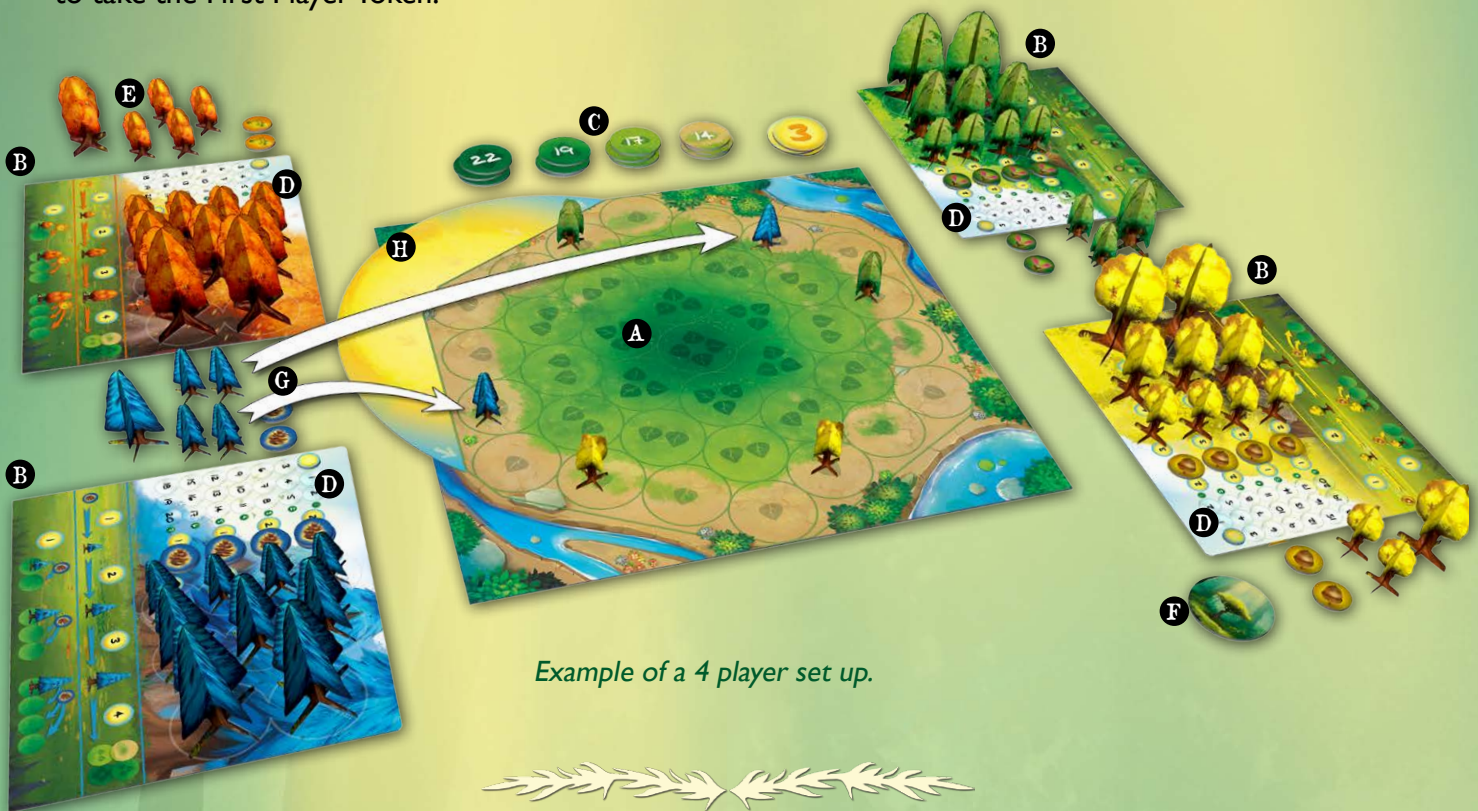
Example of a 4 player set up.

2 player game: Leave the 3 darkest green Scoring Tokens that have 4 leaves printed on them in the box, they will not be used. When players collect Scoring Tokens from the middle 4 leaf space, they instead take the tokens from the 3 leaf stack.